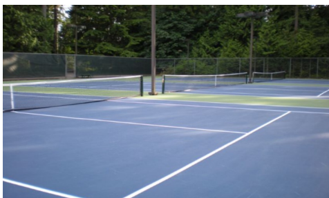
Mill Creek Tennis Club Outdoor Courts