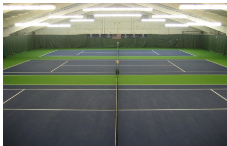
Mill Creek Tennis Club Indoor Courts

For a limited time, MCTC is waiving Initiation ( under 12 month contract) for Weekday Membership. Weekday Members are only permitted to play from 7:30AM - 3PM, Monday- Friday. The monthly dues will be determined by the type of membership. For more information, please check out our website